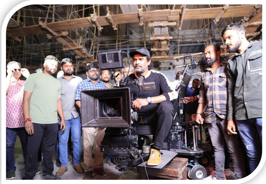
President, FTII Society, Shri. R.Madhavan at the Film Studio of FTII, Pune